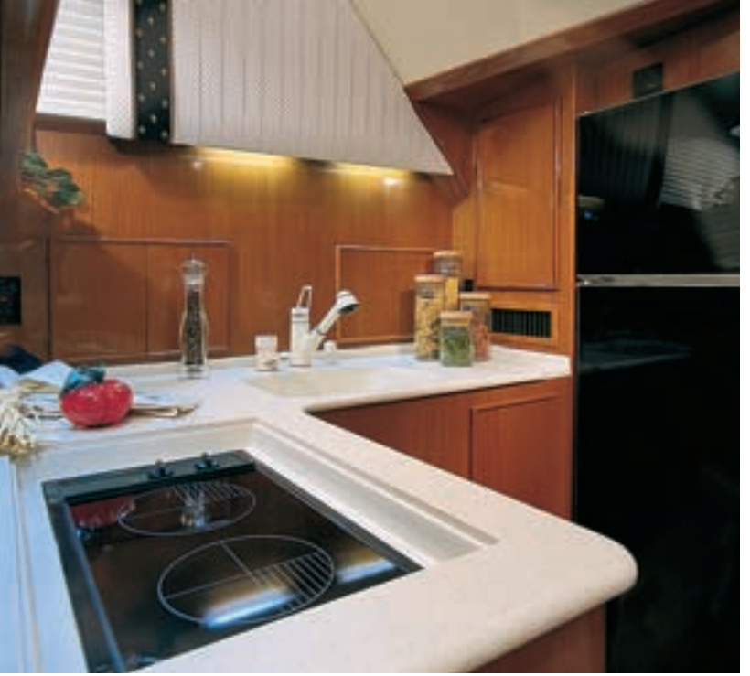
▲ Galley (above): Recessed cooktop is not only convenient, but made doubly practical with a removable cover that hides the appliance when not in use for an uninterrupted flow of Corian. The full-size refrigerator/freezer comes with a built-in ice cube maker. Indirect lighting casts a soft glow across the bookend matched joinery. Teak parquet floor is standard.