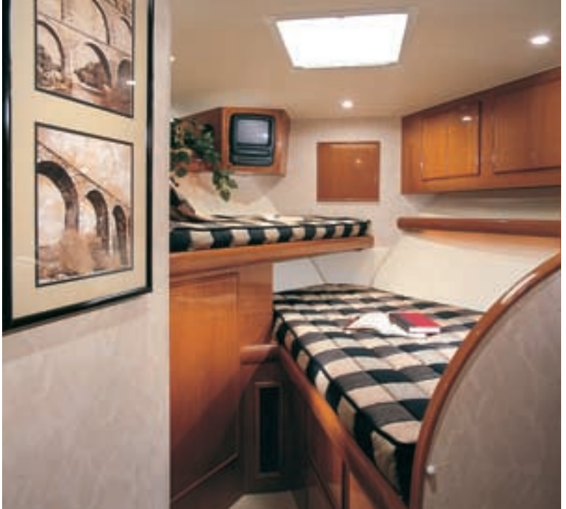
▲ Forward Stateroom (above): An optional full-size lower and single upper berth in the forward stateroom adds extra convenience for guests and children (Plan B optional layout). Hull side cabinets and shelving, bullnose moldings and plush fabrics create an inviting atmosphere. There is private access to the head, and a washer and dryer abaft the starboard berth.