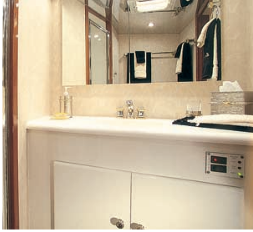
▲ Master Head (above): Accessed through the owner's stateroom, the master head offers the privacy and comfort you would expect to find aboard a quality yacht, including a fully enclosed stall shower, oversized vanity, medicine cabinet with mirror, AC with reverse cycle heat and opening overhead hatch.

Note: Post reserves the right to make changes in design, equipment, layout and/or construction without notice.