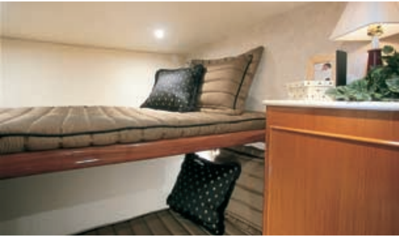
Cuest Stateroom (above): The portside guest stateroom features comfortable over and under bunks with generous drawer storage below and a large screened hatch overhead.

▼ Guest Head (below): Guest head has a fiberglass stall shower and seat. Molded countertops and vinyl flooring make clean-up a breeze. Teak and holly sole is an option.