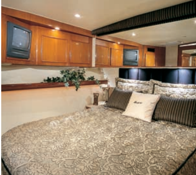
▲ Master Stateroom (above): The master suite in the Plan B version (shown here) places the cabin amidship where there is less noise and more comfort underway. The queen-size berth is accessible from three sides and features stowage below. The hanging wardrobe locker is lined with cedar and illuminates upon opening.

Featuring The Speed, Range, Performance, Comfort and Fish Raising Ability Of A Serious Tournament Contender.