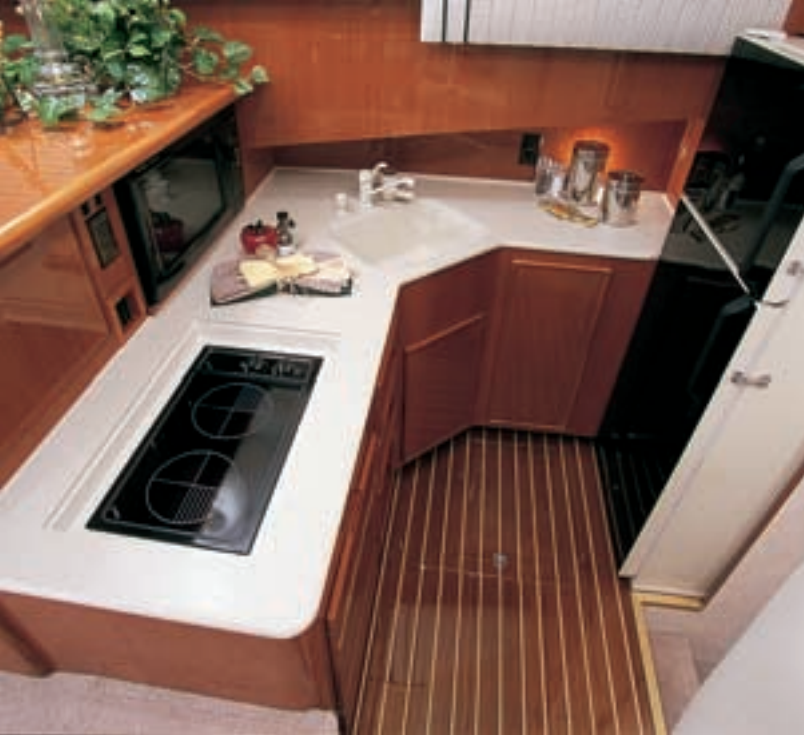
▲ Galley (above): Conveniently located two steps down from the salon, the L-shaped galley is a combination of good planning and efficiency. A microwave / convection oven and two-burner electric range will please the most fastidious cook, and there is no shortage of cabinet space or Corian countertop. The refrigerator has a built-in ice maker, and a teak door is available to complement the optional teak and holly sole.