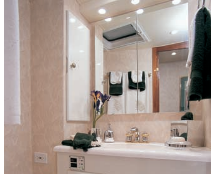
▲ Master Head (above): Reached through the master stateroom, the air conditioned head features vinyl flooring, an opaque hatch with screen and shade, a one-piece molded countertop and sink. The fiberglass stall shower has a seat, safety glass door, towel locker with light and an exhaust fan.