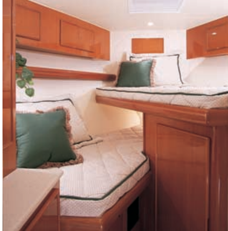
▲ Forward Stateroom (above): The Plan B arrangement offers comfortable upper and lower berths, which are ideal for guests and children. Hull sides are lined with deep stowage compartments and vinyl padding. An overhead hatch provides natural ventilation, and there is access to the anchor rode locker through the forward bulkhead. The teak privacy door to the companionway and private head is backed with a full-length mirror.