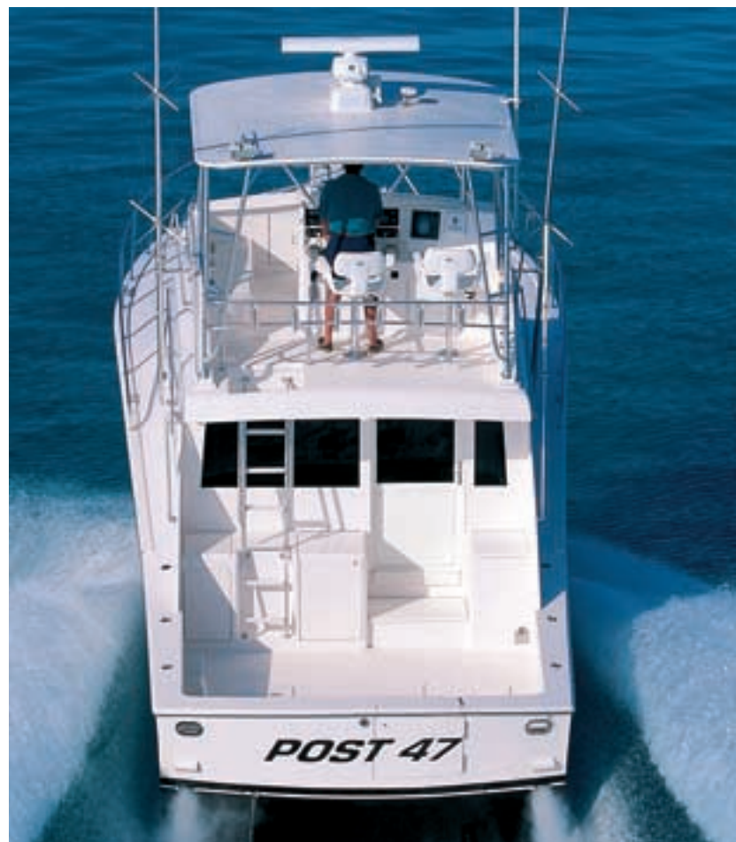
The centerline helm delivers superb all-around visibility while standing or sitting in the twin pedestal seats. Cushioned lounges to port and ahead of the console are generously sized to accommodate guests with stowage below each for fishing rods and other gear. The tournament geared cockpit features a bait-prep center, twin fishwells, tackle stowage, freezer, transom door and engine room access.

Note: Post reserves the right to make changes in design, equipment, layout and/or construction without notice.