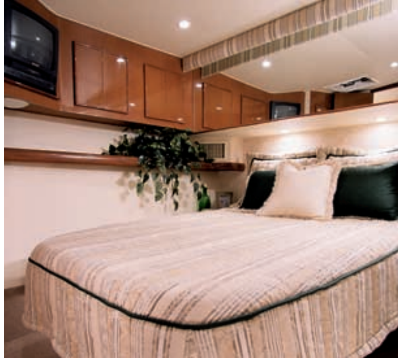
▲ Master Stateroom (above): The queen-size berth in the master stateroom (Plan B) has a six-inch mattress and an upholstered headboard. There is cedar-lined stowage beneath the berth, reverse-cycle air conditioning, indirect lighting, a Corian topped nightstand and an overhead hatch with screen and retractable shade. Plan A provides a queen-size berth forward and crisscross berths in the guest stateroom.